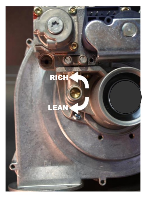
Illustration 2 - Air/Gas Mixture Ratio Screw

Combustion Field Adjustment Instructions