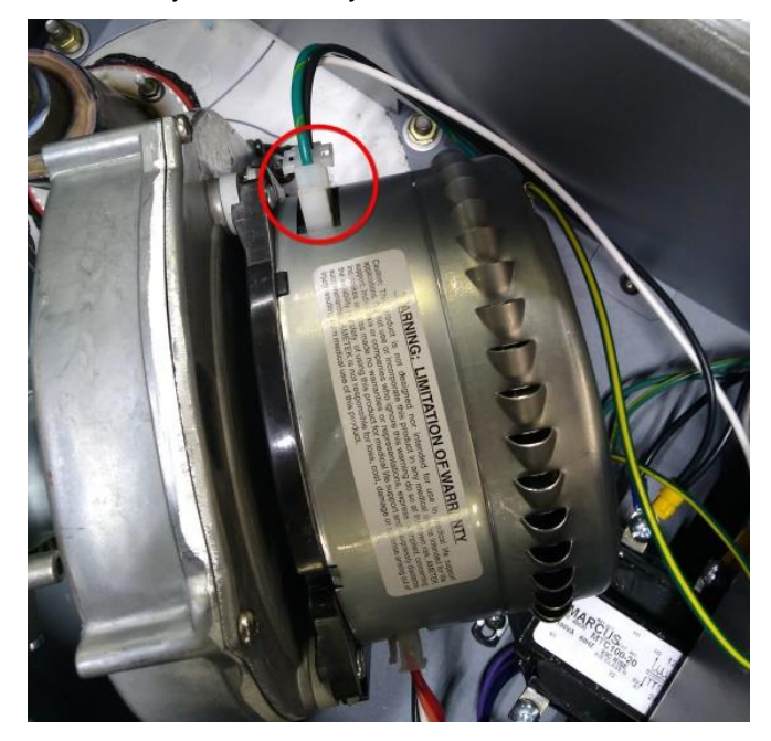
Illustration 4 - Blower Power Supply Wire

3. Cover the inlets of all the disconnected blowers using a plastic cap or tape, in order to ensure that flue gas is not coming out of the other modules' inlets while testing the module currently being adjusted.